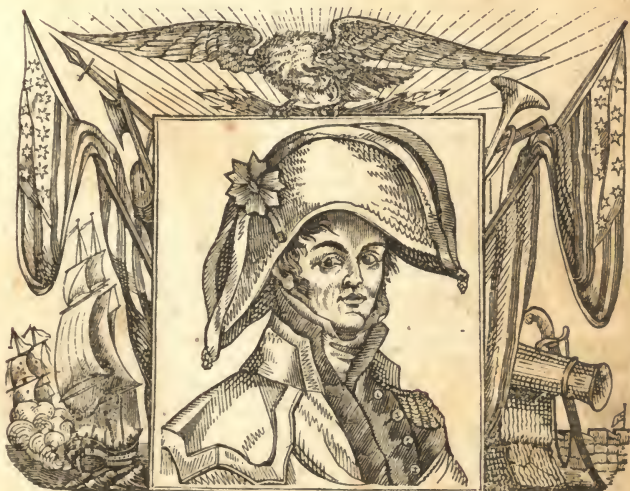
Commodore Porter, the Hero of the Pacific.—Page 213.